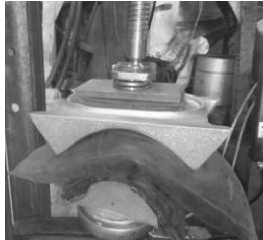
Figure 2 – Use the bag with sand