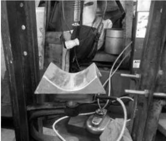
Figure 1 – The new reinforced vulcanizer frame