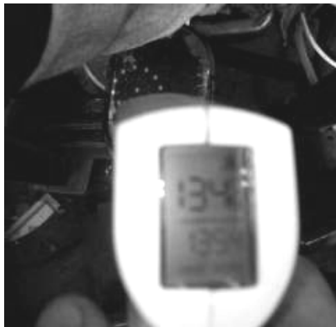
Figure 4 – The temperature definition with «Laserliner» laser pyrometer

In order to determine the optimum vulcanization and mathematical dependence regimes describing this process, the experiment planning was applied. Since the main factors influencing the vulcanization process are the heating element temperature and the pressure on