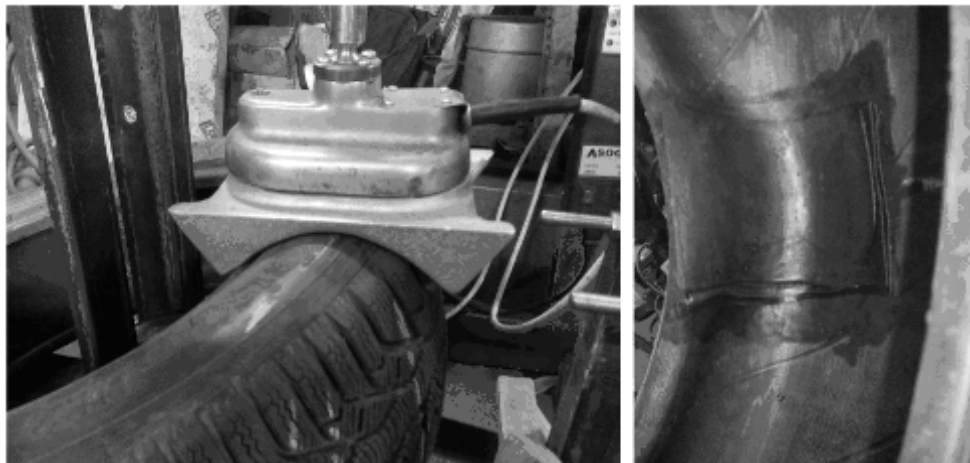
Figure 6 – The control automobile tire vulcanization