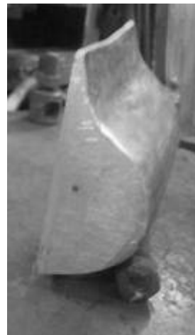
Figure 3 – A new baked form