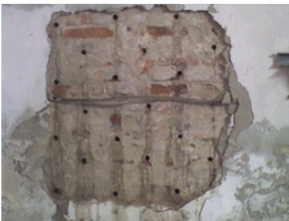
Figure 3 – Perforated wall grid

Experiment conducting methodology. The experiment was carried out in accordance with the manufacturer’s technical bulletin. The initial stage was to determine the required location (distance from the angle of the wall was 0.3 m and from the floor 0.25 m). Then, a grid was formed using a measuring tape and a pencil (Fig. 3), which determined the spots for perforation: the distance between the future openings was 0.15 m in horizontal and vertical directions (7 rows with 3 holes in each).