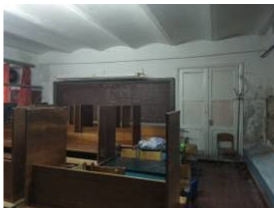
Figure 1 – General view of the experimental room

Experimental elements are external bearing walls of approximately 1.05 meter thickness. The construction of the walls has a three-layer structure: the external and internal bearing layers are made of brick, and between them there is an indent layer, which was afterwards filled with construction debris.