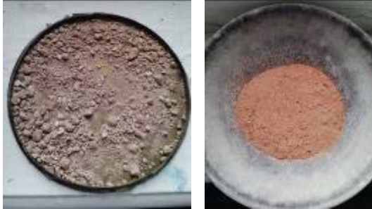
Figure 7 – Dried experimental samples of different walls

All experimental samples were weighed and then placed in the drying cabinet in a special vessel. Dry materials (Fig. 7) were re-weighed, after which the moisture content of the experimental material was determined.