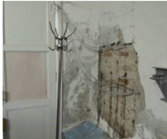
Figure 4 – The first type of experimental installation for injection waterproofing

The injection system was a construction of plastic hoses 1.5 m long, fixed on a stand 2.2 m high for the possibility of free injection in 2 rows at once, even in the highest holes (Fig. 4).