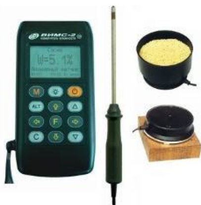
Figure 6 – General view of moisture meter “VIMS 2.21”

Device description. Universal moisture meter “VIMS 2.21” (“ВІМС 2.21”) (Fig. 6) is designed for moisture content measurements of solid and fill building materials (light, porous and heavy concrete, sand-lime and ceramic brick, building sand, stone screening dust), wood (timber, chemically untreated wooden parts and products).