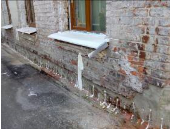
Figure 2 – General view of the experimental external wall

Waterproofing material description. AQUAMAT-F (“AKBAMAT-Φ”) injection waterproofing was chosen for the experimental study. It is a ready-to-use mixture of water-repellent silicon compounds. When the material is injected into the wall or applied to the surface of the wall for soaking, it penetrates into the smallest pores due to its low viscosity and wettability properties. The capillary structure sealing occurs due to the interaction of the hydrophobic solution with the lime, and formation of water-insoluble chemical compounds crystals that seal pores and stop the capillary penetration of salts on the structure surface. AQUAMAT-F is used mainly to block capillary moisture. It creates a barrier at the wall base, thereby protecting it from the penetration of moisture from the soil.