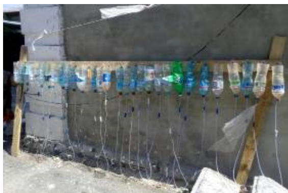
Figure 5 – The second type of experimental installation for injection waterproofing

Experimental research on the moisture content of the wall structure. Some amount of moisture is always present in the building envelope material due to the processes of sorption and condensation of water vapor, which affects the wall thermal qualities.